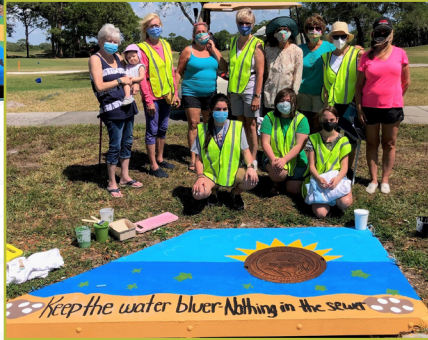
Left: 5th grade designed storm drain; Right: 4th grade designed storm drain